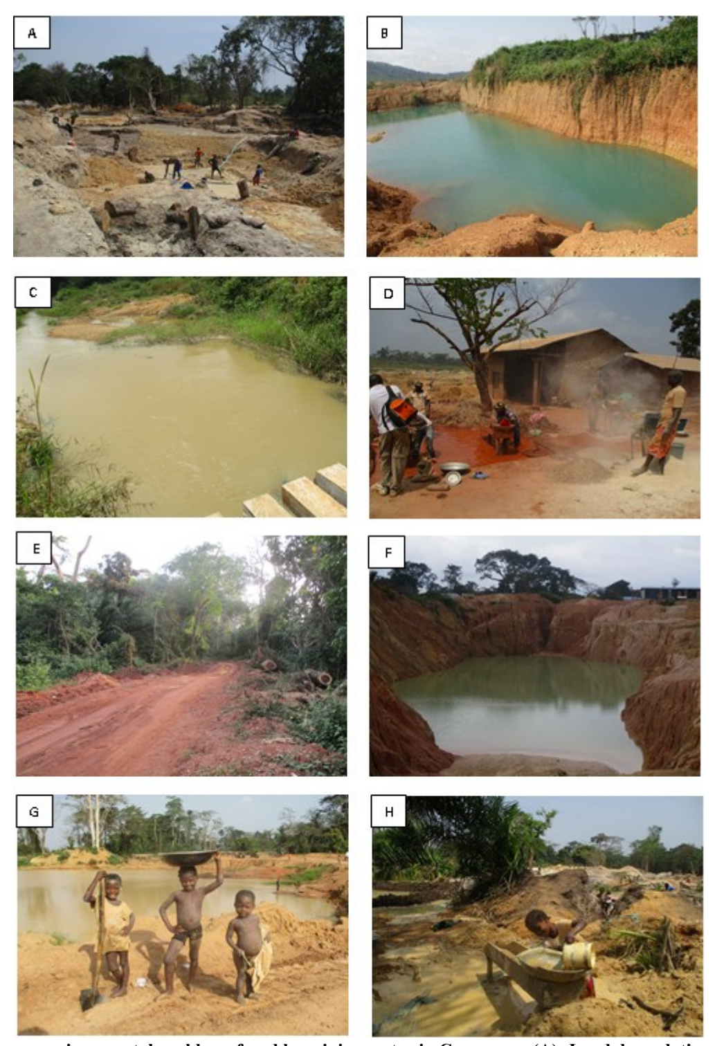
Figure 3. Some environmental problems faced by mining sector in Cameroon: (A): Land degradation due to gold mining activities in Batouri, (B): Water polluted by chemicals products in Bétaré-Oya, (C): Water polluted in Ngoura, (D): Air pollution, (E): Deforestation, (F): Abandoned mining pit, (G) and (H): Ecology disturbance and children involved in mining activities.

insecurity, famine, and health diseases. These problems bring negative points to the sustainable development of the mining sector in Cameroon.